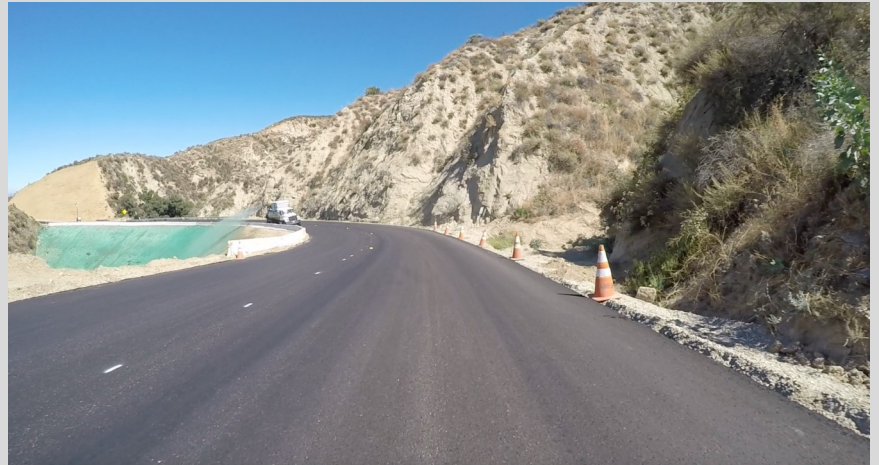
Progress on State Route 74