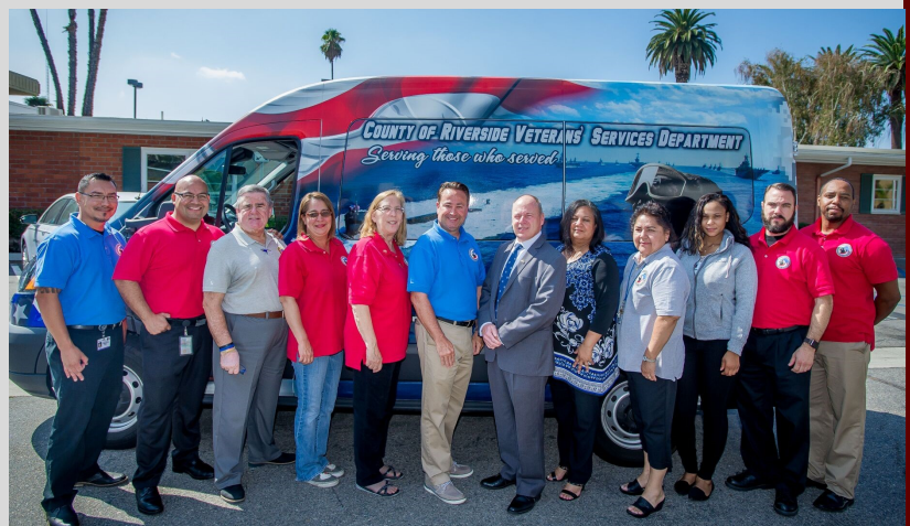
The staff of the Department of Veterans' Services

To get connected with Veterans' Services, visit veteranservices.co.riverside.ca.us/ or call 951-955-3060.