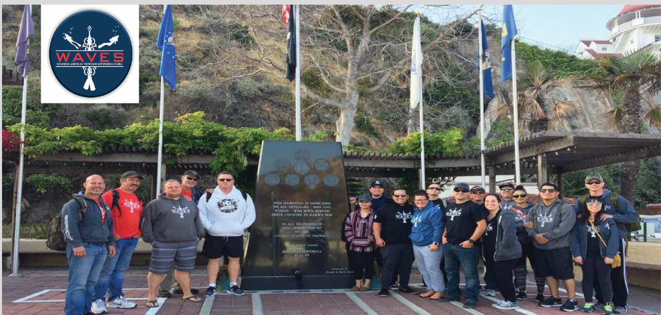
WAVES Project divers at the Veterans' Memorial in Avalon, Catalina Island, California

One WAVES Project program that has a tremendous impact on veterans is the Mission Oriented Diving project, where they partner with the National Parks Service for historical and environmental conservation projects. In July 2019, a group of eight veteran divers worked with Dry Tortugas National Park in Florida assisting with buoy maintenance and environmental conservation efforts. ( cont'd p. 8 )