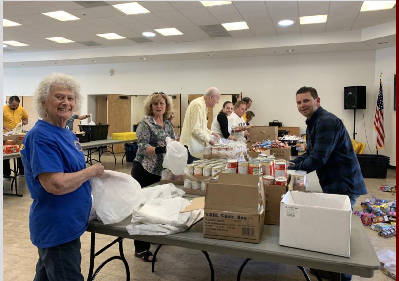
Volunteers pack meals for the SAM Program.

*Please note that the registration date for Christmas 2019 assistance has passed. Families interested in signing up for next year's event can contact Lt. Fleming next September.