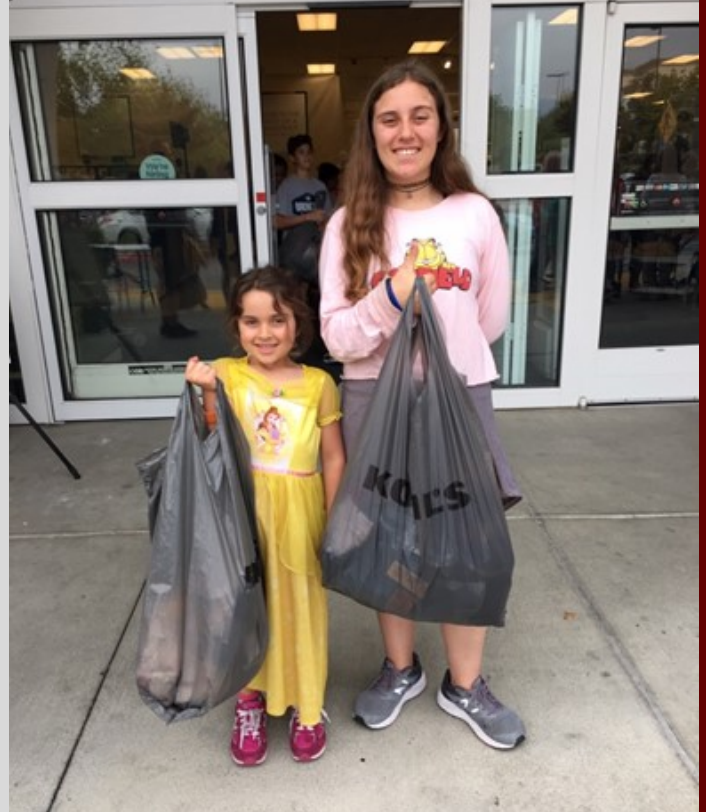
Happy Operation School Bell students leaving with their new clothes.